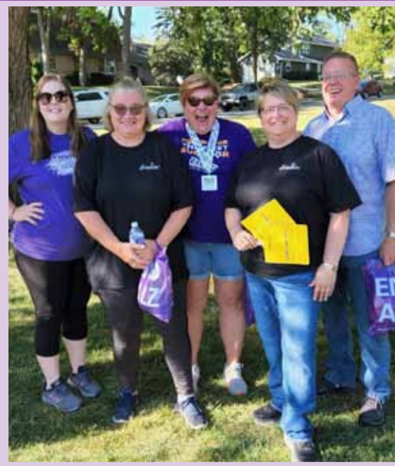
Team Eventide participated in the West Central Iowa Walk to End Alzheimer's. With the help of our loyal families, friends and team members, we were able to raise over $1,700 for the cause. Together we can End Alzheimer's!

The Eventide campus will have influenza and COVID vaccines available for residents and tenants around the beginning of October