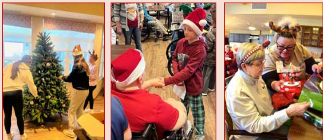
Gracewell kept busy this season by decorating trees with the Monarch Basketball Team, crafting, listening to holiday carolers and watching their favorite Christmas movies! Thank you to those who made the holiday season special for our residents.